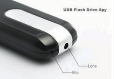
Above: GoPro cameras fit nicely onto a pair of glasses; A woman takes a picture of her friends (or others); Someone holding up a surfboard with a camera hold in it; A fake thumbnail drive that is actually a camera can fit in the palm of your hand.