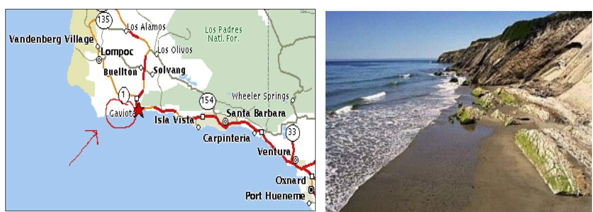
Map to the San Onofre nude section of Gaviota State Beach

If your Beach Walk includes Gaviota Beach, be sure to remind people to take out their trash. If any lewd behavior is observed, use your Beach Ambassador training skills to shame these characters away as they are easily motivated to leave if discovered in the dunes and high grass at the back of the sand.