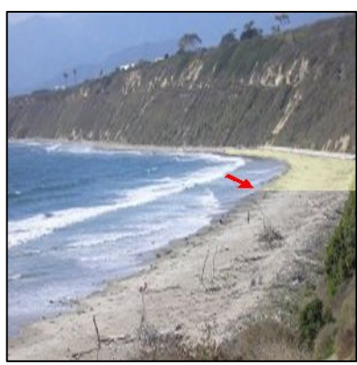
Bates (North Rincon) Beach

Current Status : Local nudists are currently working to restore Bates for nude use. At present, it is not considered safe for nudity, but deputies only come down periodically. Go as far north as possible, north of the concrete barrier to be reasonably safe. Read this "Current Bates News" link for the latest information: