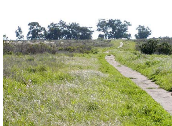
Map to More Mesa Beach and the mile-long path across the mesa above.

Local residents are noticing a growing influx of college- and high-school-age people over the last two years, tromping toward the bluff's edge and then navigating a rocky trail down to the caves, hauling logs for campfires and coolers filled with food and drinks. The caves are tall enough to stand in and roomy enough for campers to build fires and drink beer. Some draw graffiti on the large boulders that form the caves' jagged mouths. Residents of Hope Ranch have long complained that the unwelcome visitors trespass on their property and climb over their fences to gain access to the three caves carved into the sandstone bluff rising above the Pacific.