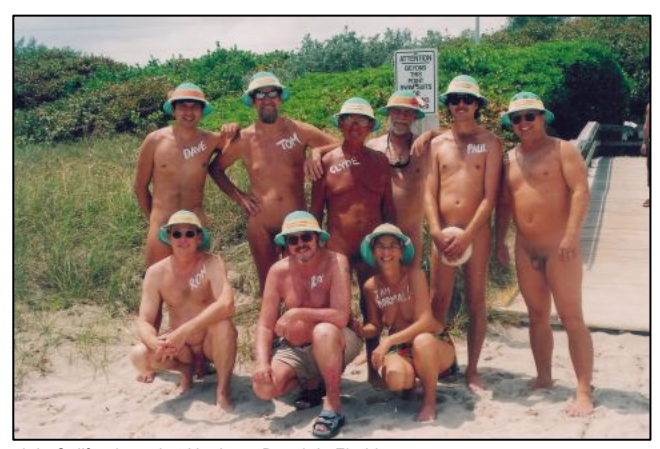
(I-r): Beach Ambassadors at Black's Beach in California and at Haulover Beach in Florida